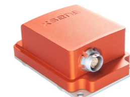
MTi encased: 57x42x23.5 mm, 52g, 9-pins push-pull connector