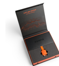
MTi 10-series Development Kit: MTi, software and cabling