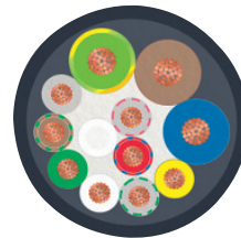
PUR/PVC black [PUR]