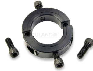
*Additional hardware NOT included