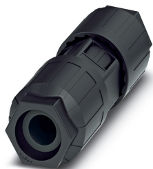
QUICKON cable connector, black, 4+PE-pos., 2.5 mm 2 ... 6.0 mm 2 /690 V/40 A, for cable diameter of 12 mm ... 20 mm.

Please be informed that the data shown in this PDF Document is generated from our Online Catalog. Please find the complete data in the user's documentation. Our General Terms of Use for Downloads are valid ( http://phoenixcontact.com/download )