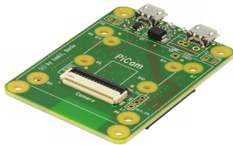
fig.1: PiCam module topview

The PiCam module is an adapter board to assemble one of the smallest Raspberry camera systems in the world. You can connect the Raspberry Pi compute module 4 (cm4 and camera, not included) and one of the many different camera sensors related to the Raspberry Pi with a 15-pin RPi connector. It can be easily realized. All you have to do, is plug in the Raspberry cm4 on the bottom of the PiCam board and connect the FFC/FPC ribbon cable of the camera sensor to the FFC connector of the PiCam module. If required, the camera module can also be mounted directly on the PiCam adapter, achieving maximum compactness. The available mounting holes cover a large number or the majority of Raspberry camera modules.