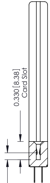
0.125 [3.18] Point of Contact — SECTION A-A

See Accompanying Page for: • Mounting Options