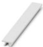
Zack marker strip, Strip, white, unlabeled, can be labeled with: Plotter, Mounting type: Snap into tall marker groove, for terminal block width: 22 mm, Lettering field: 10.5 x 21.8 mm

Zack marker strip - ZB 22:UNBEDRUCKT - 0811862