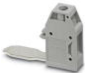
Pick-off terminal block, Connection method: Screw connection, Cross section: 0.5 mm 2 - 10 mm 2 , AWG: 20 - 8, Width: 10.2 mm, Height: 34.7 mm, Color: gray, Mounting type: On base element

Pick-off terminal block - AGK 10-UKH 150/240 - 3003554