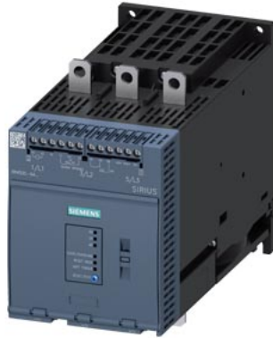
SIRIUS soft starter 200-480 V 143 A, 110-250 V AC Screw terminals Analog output