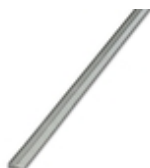
Continuous plug-in bridge, length: 500 mm, color: gray

Continuous plug-in bridge - FBST 500-PLC GY - 2966838