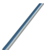
Continuous plug-in bridge, length: 500 mm, color: blue

Continuous plug-in bridge - FBST 500-PLC BU - 2966692