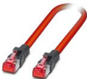
Patch cable, degree of protection: IP20, cable length: 20 m, number of positions: 8, 10 Gbps, CAT6 A

Please be informed that the data shown in this PDF Document is generated from our Online Catalog. Please find the complete data in the user's documentation. Our General Terms of Use for Downloads are valid ( http://phoenixcontact.com/download )