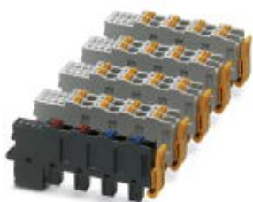
Axioline F plug set (for e.g., AXL F DI32/1 2H)

Please be informed that the data shown in this PDF Document is generated from our Online Catalog. Please find the complete data in the user's documentation. Our General Terms of Use for Downloads are valid ( http://phoenixcontact.com/download )