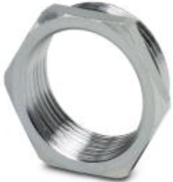
Reducing adapter, material: Brass, nickel-plated, connecting thread: Pg29, color: silver, with O-ring

Please be informed that the data shown in this PDF Document is generated from our Online Catalog. Please find the complete data in the user's documentation. Our General Terms of Use for Downloads are valid ( http://phoenixcontact.com/download )