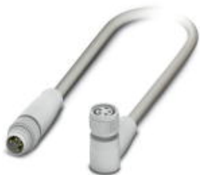
Sensor/actuator cable, 4-position, PP-EPDM halogen-free, gray RAL 7035, Plug straight M8, on Socket angled M8, with 2 LEDs, cable length: 3 m, Hygienic design, with plastic knurl

Please be informed that the data shown in this PDF Document is generated from our Online Catalog. Please find the complete data in the user's documentation. Our General Terms of Use for Downloads are valid ( http://phoenixcontact.com/download )