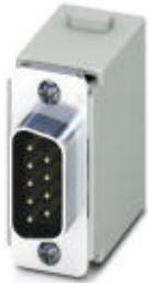
Contact insert module, number of positions: 9, type : D-SUB 9, Pin, Crimp connection, 50 V, 1 A, 0.08 mm² ... 0.5 mm², application: Data, without crimp contacts

Please be informed that the data shown in this PDF Document is generated from our Online Catalog. Please find the complete data in the user's documentation. Our General Terms of Use for Downloads are valid ( http://phoenixcontact.com/download )