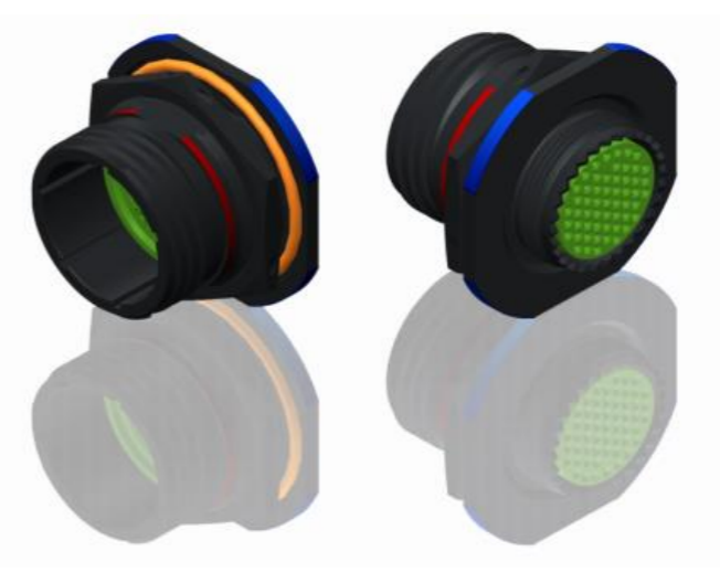
LAYOUT SHOWN AS EXAMPLE