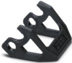
Replacement double locking latch for HEAVYCON EVO housing, HC-B10/HC-B16/HC-B24, PA

Please be informed that the data shown in this PDF Document is generated from our Online Catalog. Please find the complete data in the user's documentation. Our General Terms of Use for Downloads are valid ( http://phoenixcontact.com/download )