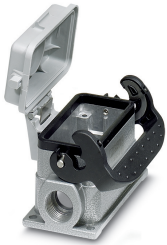
HEAVYCON box mounting base B6, with single locking latch and cover. Height 52 mm, with supports 2xM20

Please be informed that the data shown in this PDF Document is generated from our Online Catalog. Please find the complete data in the user's documentation. Our General Terms of Use for Downloads are valid ( http://phoenixcontact.com/download )