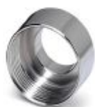
Step-up adapter, M20 to M25, including O-ring

Extension adapter - ENLAR-M-KV-M20/M25 - 1647666