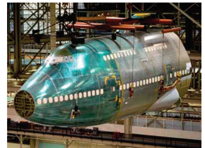
Cabling in passenger area plenums aboard aircraft are a perfect application for Flexo® PFA's low outgassing properties.