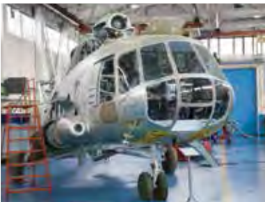
Clean Cut FR is a common harness material for both military and civilian aircraft.

The combination of flame retardance, ease of installation, and nearly complete coverage makes Clean Cut FR an ideal solution for many industrial and advanced engineering applications.