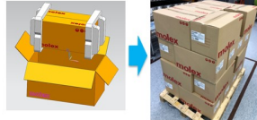
Packaging before change