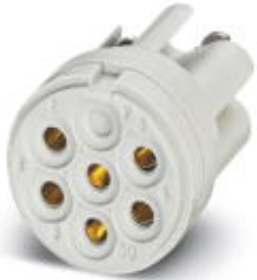
Contact insert, Number of positions: 6, Type of contact: Socket, Screw connection

Please be informed that the data shown in this PDF Document is generated from our Online Catalog. Please find the complete data in the user's documentation. Our General Terms of Use for Downloads are valid ( http://phoenixcontact.com/download )