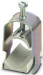
Cable clamp, for DIN rails

Please be informed that the data shown in this PDF Document is generated from our Online Catalog. Please find the complete data in the user's documentation. Our General Terms of Use for Downloads are valid ( http://phoenixcontact.com/download )