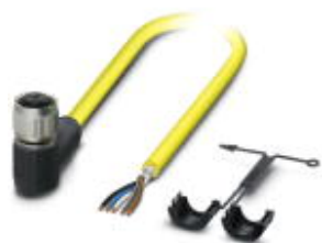
Sensor/actuator cable, 5-position, PVC, yellow, shielded, free cable end, on Socket angled M12 SPEEDCON, A-coded, cable length: 5 m

Please be informed that the data shown in this PDF Document is generated from our Online Catalog. Please find the complete data in the user's documentation. Our General Terms of Use for Downloads are valid ( http://phoenixcontact.com/download )