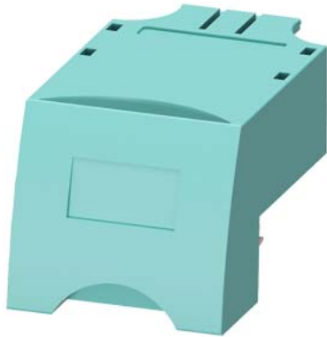
Cable connector size S00 Spring-type terminal