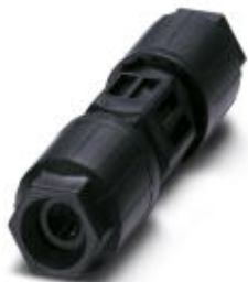
QUICKON cable connector, black, 4+PE-pos., 1.0 mm 2 ... 2.5 mm 2 / 690 V / 20 A, for 6 mm ... 11 mm cable diameter.

Please be informed that the data shown in this PDF Document is generated from our Online Catalog. Please find the complete data in the user's documentation. Our General Terms of Use for Downloads are valid ( http://phoenixcontact.com/download )