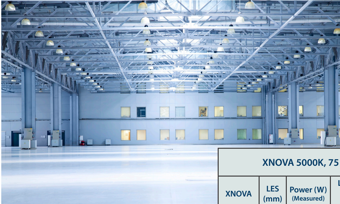
XNOVA 5000K, 75 CRI Minimum