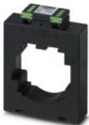
Window-type current transformer, 2000 A AC primary current; 5 A AC secondary current; accuracy class 1; 10 VA rated power

Please be informed that the data shown in this PDF Document is generated from our Online Catalog. Please find the complete data in the user's documentation. Our General Terms of Use for Downloads are valid ( http://phoenixcontact.com/download )