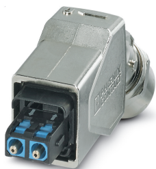
Push-pull connector (version 14), die-cast zinc, with SC-RJ insert for POF, for cable diameter of 5.5 mm ... 10 mm, cable outlet at the bottom

Please be informed that the data shown in this PDF Document is generated from our Online Catalog. Please find the complete data in the user's documentation. Our General Terms of Use for Downloads are valid ( http://phoenixcontact.com/download )