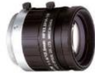
Figure 1-c. Fujinon lens