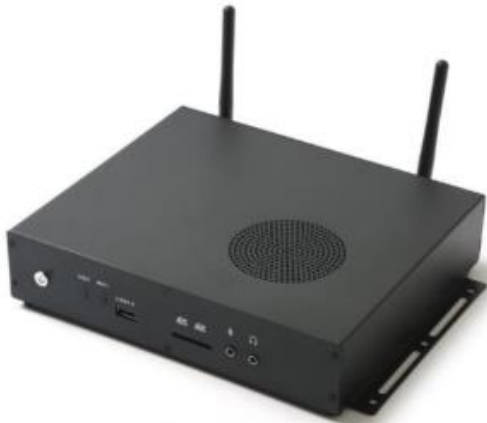
Figure 1-a. MIRAI robot controller incl. power supply and L-mount

The MIRAI UX1 kit includes key components that are required to set up the MIRAI robot control subsystem for a Universal Robot arm. The following components are included in the kit: