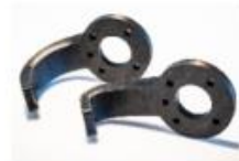
Figure 1-d. camera fixtures