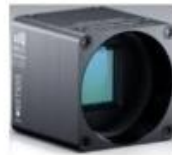
Figure 1-b. Ximea xiQ USB3