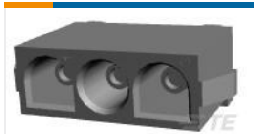
TE Part #350760-4 03P UMNL HDR ASSY PC