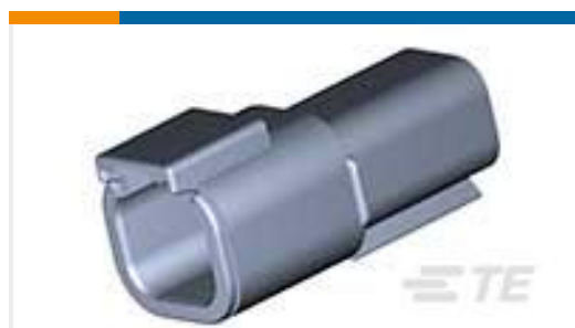
TE Part #DTMH04-4PA REC, 4P, BLK, N, HI TEMP, A