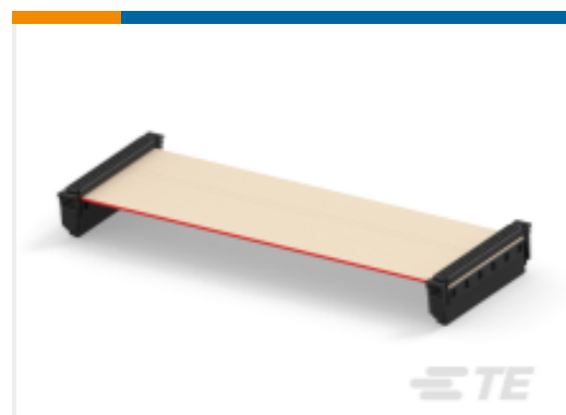
TE Part #173793-E IDCCS SMC 1,27 50 * AU AUI 100 PVC RD J