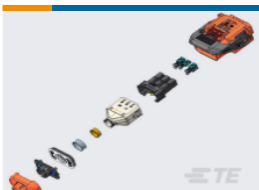
TE Part #YHVA630-5PHM-6MM-A HVA630-5pmm,5x6sqmm,Key A