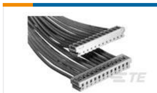
TE Part #2-179228-4 CT CRIMP-2 REC HSG 4P BLUE