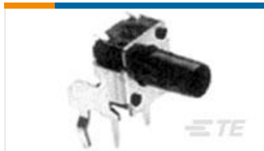
TE Part #1571300-2 TACT,RTANG,SMT,SEALED,GUID PIN