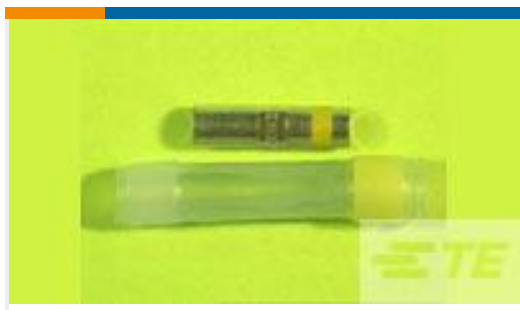
TE Part # 650076-000 D-436-38