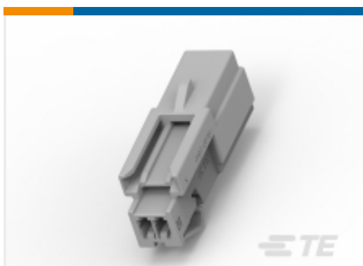
TE Part #2138558-2 2P GENERATION Y Cap, Single-Pi