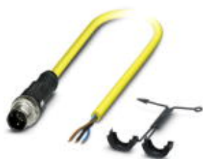
Sensor/actuator cable, 3-position, PVC, yellow, Plug straight M12 SPEEDCON, A-coded, on free cable end, cable length: 5 m

Please be informed that the data shown in this PDF Document is generated from our Online Catalog. Please find the complete data in the user's documentation. Our General Terms of Use for Downloads are valid ( http://phoenixcontact.com/download )