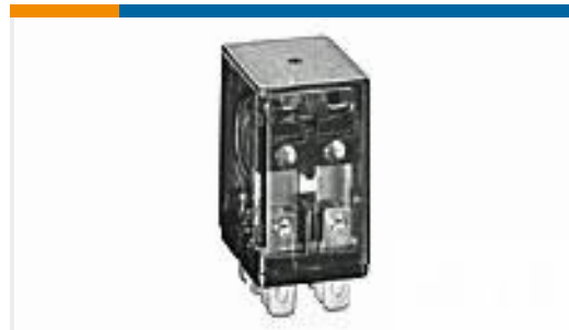
TE Part #5-1393144-4 K10P-11D15-110=K10/K20