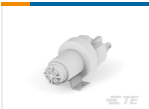
TE Part #K1060542 Relay 26-55-710