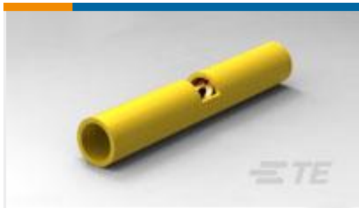
TE Part #2-323994-1 PIDG BUTT SPLC WDW 26-22; TAPE