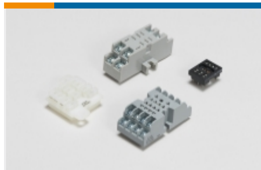
Relay Accessories, Sockets & Clips(3)