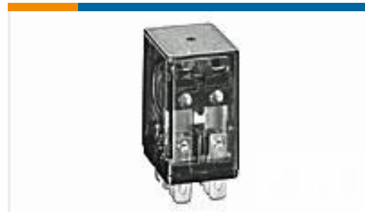
TE Part #5-1393144-9 K10P-11D15-48=K10/K20