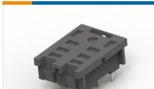
TE Part #2-1419106-1 27E489=SOCKET,K10,8,QC.187,NYL