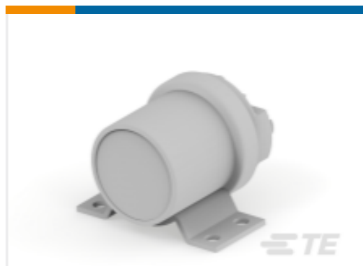
TE Part #K1021595 Relay 26-71-04