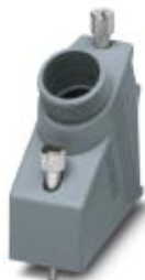
Plastic sleeve housing, locking screws with knurled head, type 2, cable screw connection Pg21

Please be informed that the data shown in this PDF Document is generated from our Online Catalog. Please find the complete data in the user's documentation. Our General Terms of Use for Downloads are valid ( http://phoenixcontact.com/download )