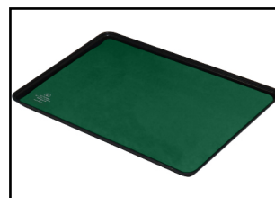
Cut to fit 16" x 24" cafeteria trays.

Specifications and procedures subject to change without notice.