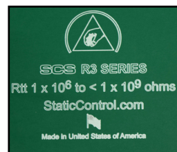
Mat tray liners are laser engraved for branding and auditing purposes.

RoHS, REACH and Conflict Minerals, Statement See the Desco Industries RoHS, REACH, and Conflict Minerals Statement: DescoIndustries.com/ROHS3.aspx See the SCS Limited Warranty: StaticControl.DescoIndustries.com/Limited-Warranty.aspx