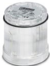
LED permanent light element, 24 V DC, 7 colors

Please be informed that the data shown in this PDF Document is generated from our Online Catalog. Please find the complete data in the user's documentation. Our General Terms of Use for Downloads are valid ( http://phoenixcontact.com/download )