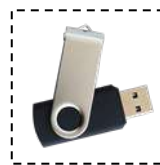
USB Flash Disk