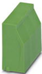
DIN rail housing, Filler plug for unoccupied terminal points, color: green (6021)

Please be informed that the data shown in this PDF Document is generated from our Online Catalog. Please find the complete data in the user's documentation. Our General Terms of Use for Downloads are valid ( http://phoenixcontact.com/download )