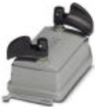
HEAVYCON ADVANCE IP65 protective cover B10, with bayonet locking, with retaining cord, diameter of retaining cord eyelet 3 mm

Protective covers - HC-B 10-TMB-SD-IP65 - 1690943