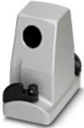
HEAVYCON ADVANCE EMV sleeve housing B10, with bayonet locking, height 100 mm, with 1xM32 thread, lateral cable outlet

Please be informed that the data shown in this PDF Document is generated from our Online Catalog. Please find the complete data in the user's documentation. Our General Terms of Use for Downloads are valid ( http://download.phoenixcontact.com )