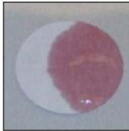
t = 5 sec.