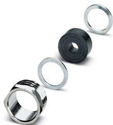
Cable gland, shielded: no, cable diameter range: 8 mm ... 12 mm

Please be informed that the data shown in this PDF Document is generated from our Online Catalog. Please find the complete data in the user's documentation. Our General Terms of Use for Downloads are valid ( http://phoenixcontact.com/download )