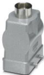
HEAVYCON B10 sleeve housing, for double locking latch, height: 72 mm, with 1 x Pg21 gland, straight cable outlet

Please be informed that the data shown in this PDF Document is generated from our Online Catalog. Please find the complete data in the user's documentation. Our General Terms of Use for Downloads are valid ( http://phoenixcontact.com/download )