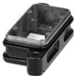
HEAVYCON B6 panel mounting base, HPR series, for screw locking, for increased environmental and EMC requirements

Please be informed that the data shown in this PDF Document is generated from our Online Catalog. Please find the complete data in the user's documentation. Our General Terms of Use for Downloads are valid ( http://phoenixcontact.com/download )