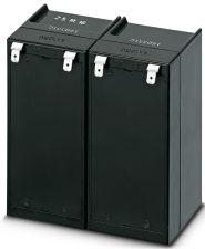
Replacement battery for UPS-BAT/VRLA... energy storage

Please be informed that the data shown in this PDF Document is generated from our Online Catalog. Please find the complete data in the user's documentation. Our General Terms of Use for Downloads are valid ( http://phoenixcontact.com/download )