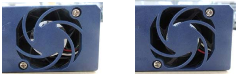
Fig. 2.1 Description of Changes (Left : Current, Right : After Change)