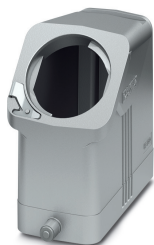
HEAVYCON EVO sleeve housing, EMC version, without powder coating, with bayonet flange for EVO screw connection, B16, for single locking latch, height: 88 mm, without EVO screw connection.

Please be informed that the data shown in this PDF Document is generated from our Online Catalog. Please find the complete data in the user's documentation. Our General Terms of Use for Downloads are valid ( http://phoenixcontact.com/download )