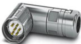
The figure shows the 6-pos. product version with solder contacts

Cable connector, angled, shielded: yes, SPEEDCON locking, M23, No. of pos.: 8+1, type of contact: Pin, Crimp connection, cable diameter range: 4 mm ... 6 mm