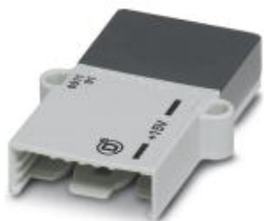
SmartWire DT™ bus termination plug

Please be informed that the data shown in this PDF Document is generated from our Online Catalog. Please find the complete data in the user's documentation. Our General Terms of Use for Downloads are valid ( http://phoenixcontact.com/download )