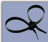
Dual Loop Cable Ties

ACT ADVANCED CABLE TIES, INC. 245 Suffolk Lane, Gardner, MA 01440 Phone: 800.861.7228 - Fax: 978.630.3999 sales@actfs.com