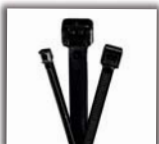
Heat Stabilized UV Black Nylon 66