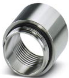
NPT adapter, IP68, up to 5 bar, incl. O-ring seal, M32 to 1"

Please be informed that the data shown in this PDF Document is generated from our Online Catalog. Please find the complete data in the user's documentation. Our General Terms of Use for Downloads are valid ( http://phoenixcontact.com/download )