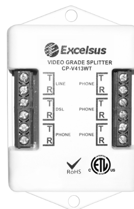
CP-V413WT VDSL2 Video-Grade CPE Splitter

The CP-V413WT Video-Grade CPE Splitter is one of many splitters and filters manufactured by Excelsus, a brand of Pulse, for digital services within homes, offices, and hotels. Excelsus is the number one selling brand of DSL filters and splitters worldwide.